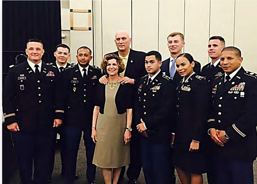
GEN (Ret) Raymond T. Odierno