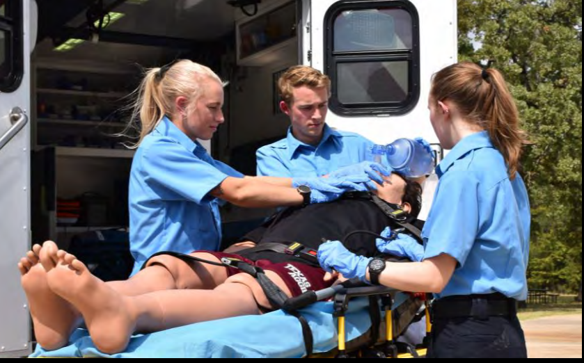
TEXAS A&M ENGINEERING