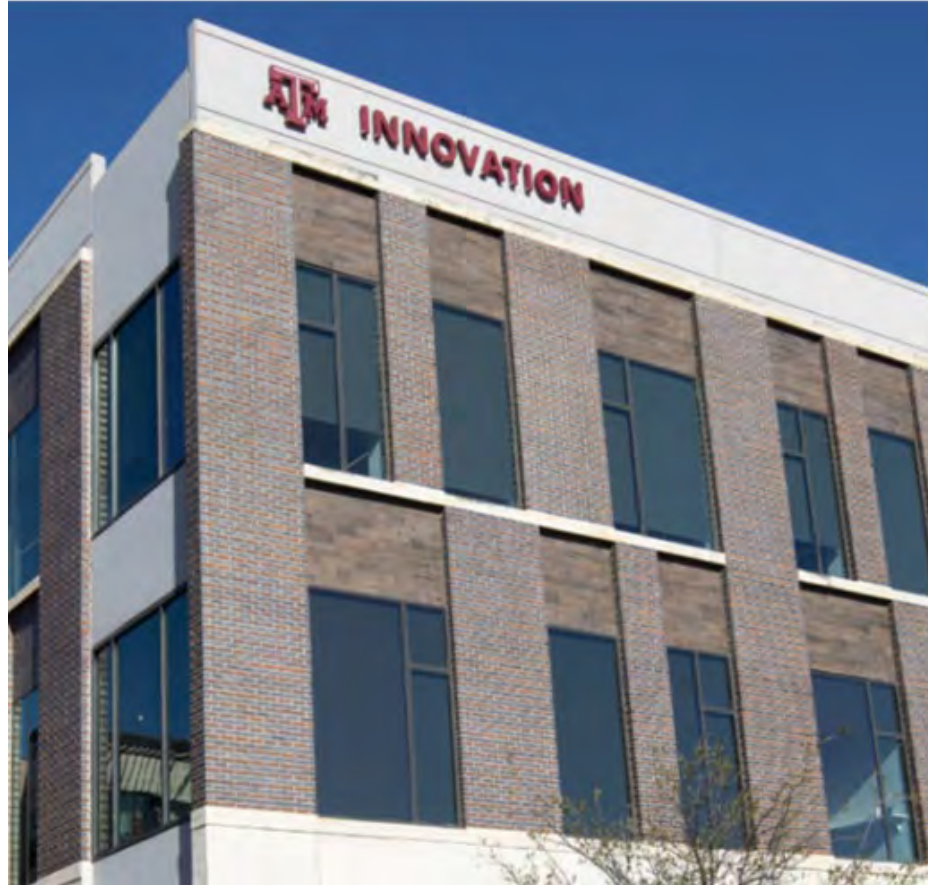
Texas A&M Innovation