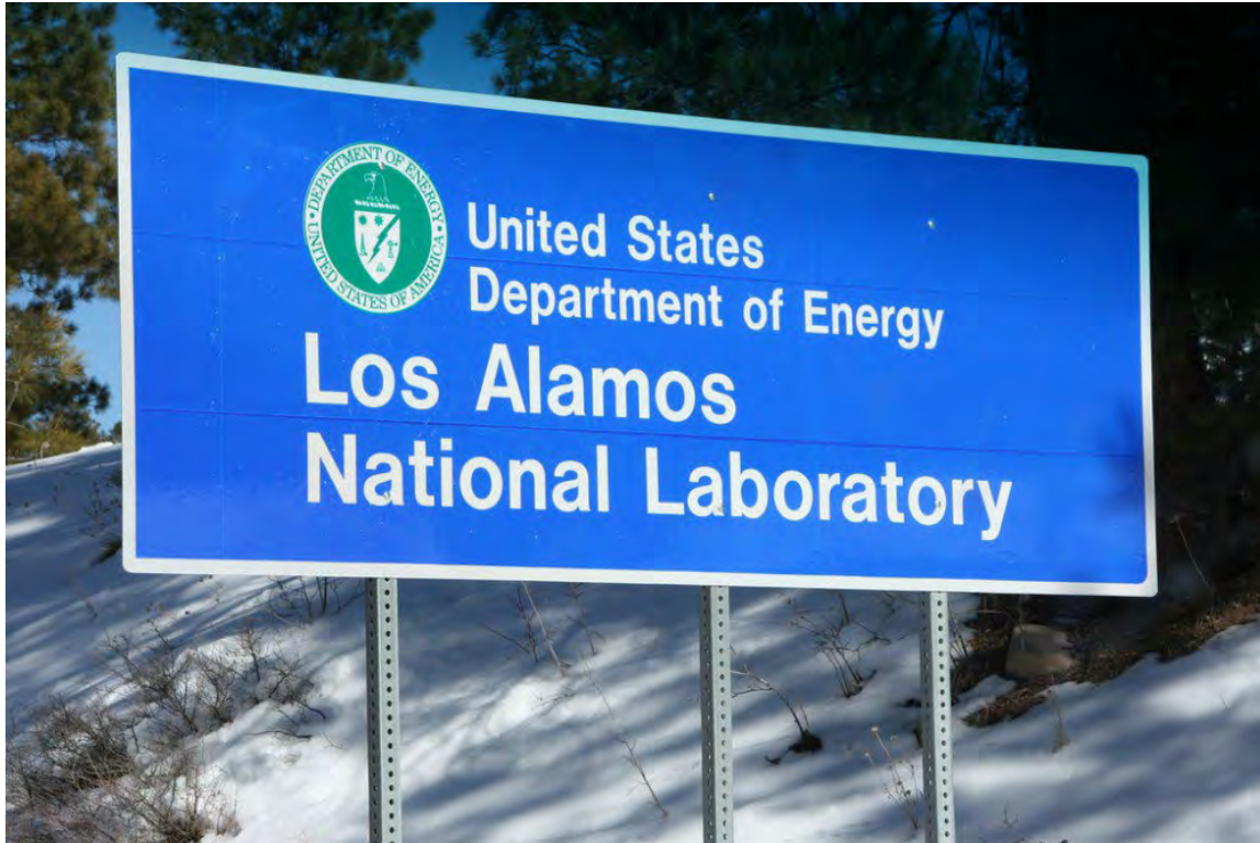
Los Alamos National Laboratory