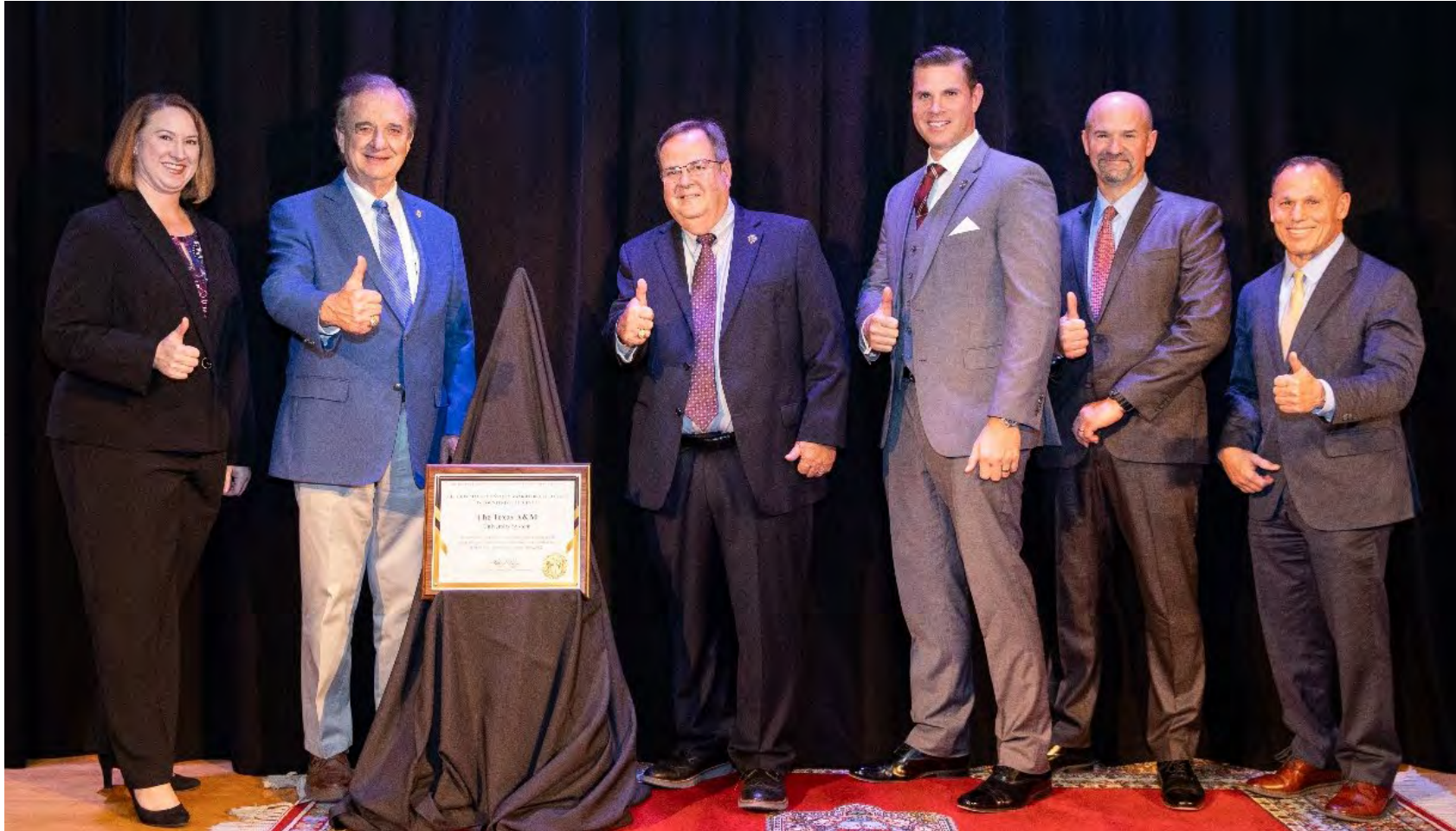
Jack Donnelly Award for Excellence in Counterintelligence