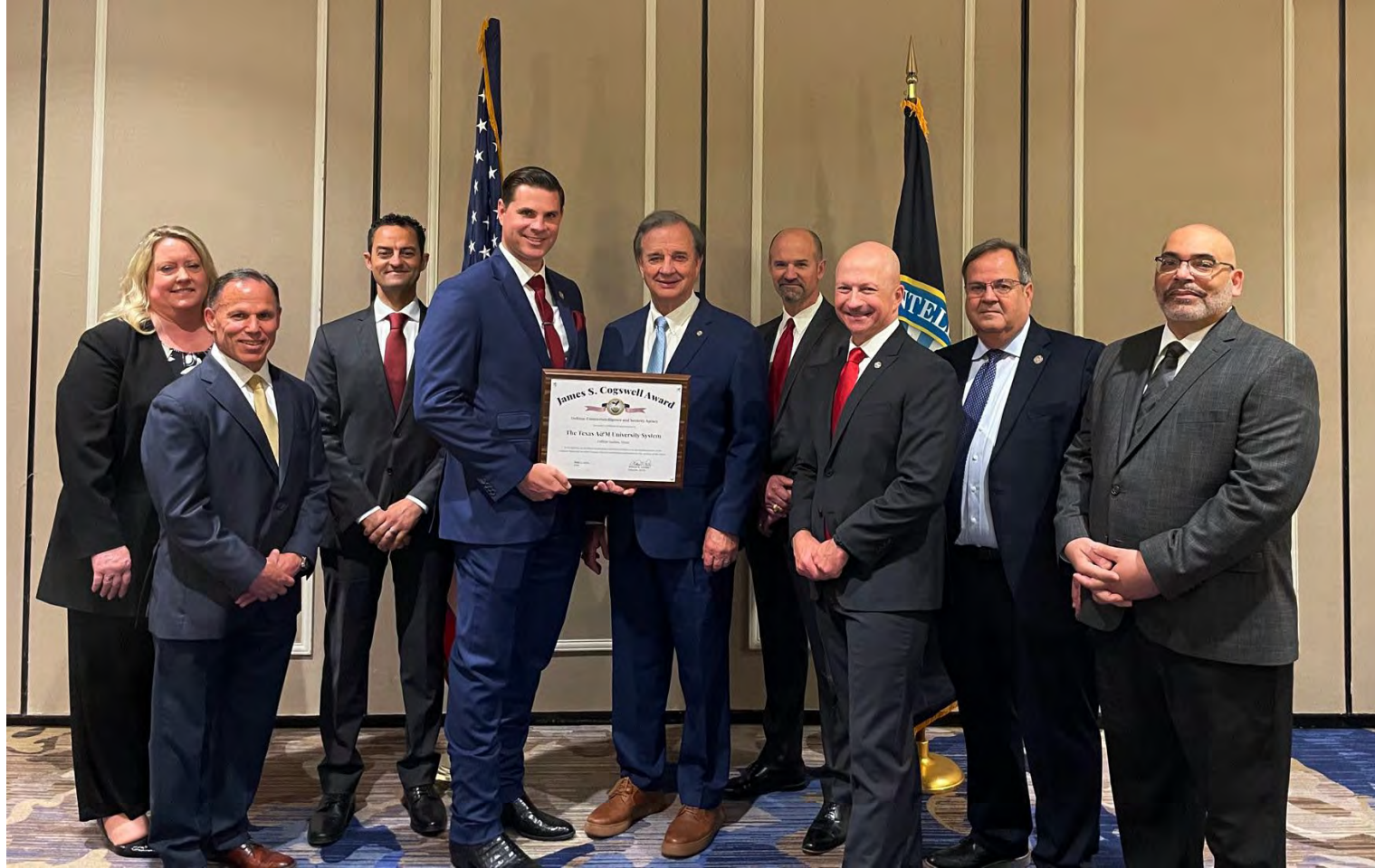
James S. Cogswell Award