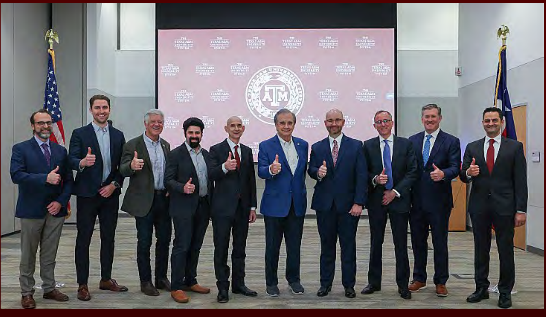
Four companies bring small modular nuclear reactors to A&M