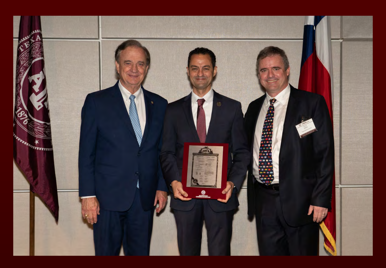
2023 Patent Award Event